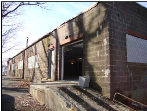
Exterior of Side Loading Dock