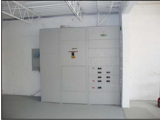
600 Amp Electrical Service