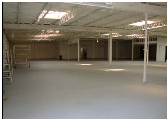
22' Column Spacing on Center

No warranty of representation, express or implied is made as to the accuracy of the information contained herein, and same is submitted subject to errors, omissions, change of price, rental or other conditions, withdrawal without notice and to any special listing conditions imposed by our principals.