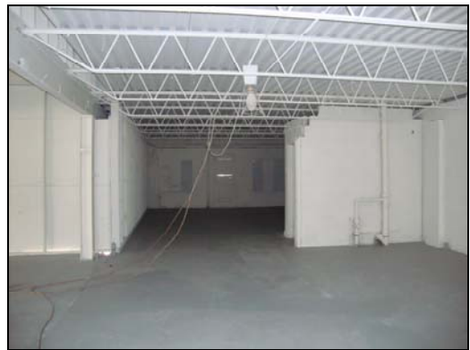
Front Reception Area