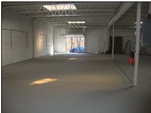
Interior Area of Side Loading Dock